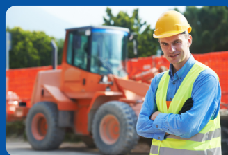
AUTOMATED DRIVERS' TIME TRACKING AND IDENTIFICATION