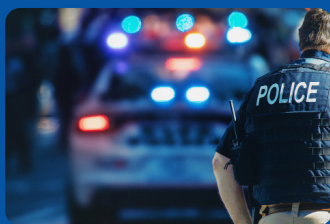
POLICE FLEET MANAGEMENT