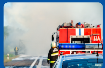
PREDICTIVE MAINTENANCE OF EMERGENCY VEHICLES