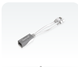
Gigabit PoE injector