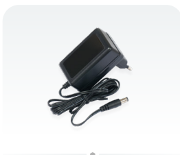
24 V 0.8 A power adapter